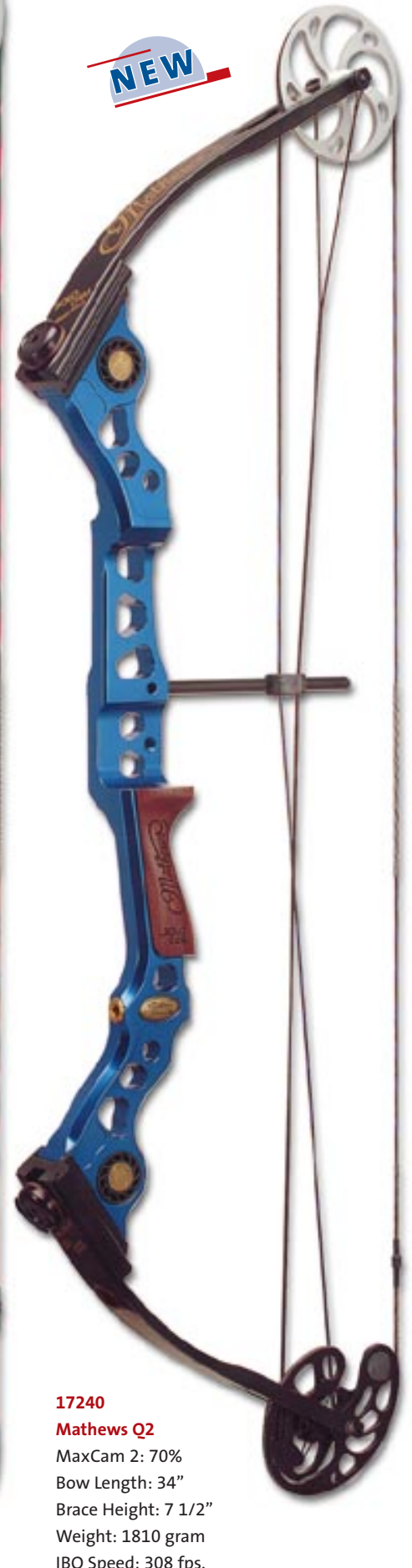
17240 Mathews Q2 MaxCam 2: 70% Bow Length: 34" Brace Height: 7 1/2" Weight: 1810 gram IBO Speed: 308 fps.