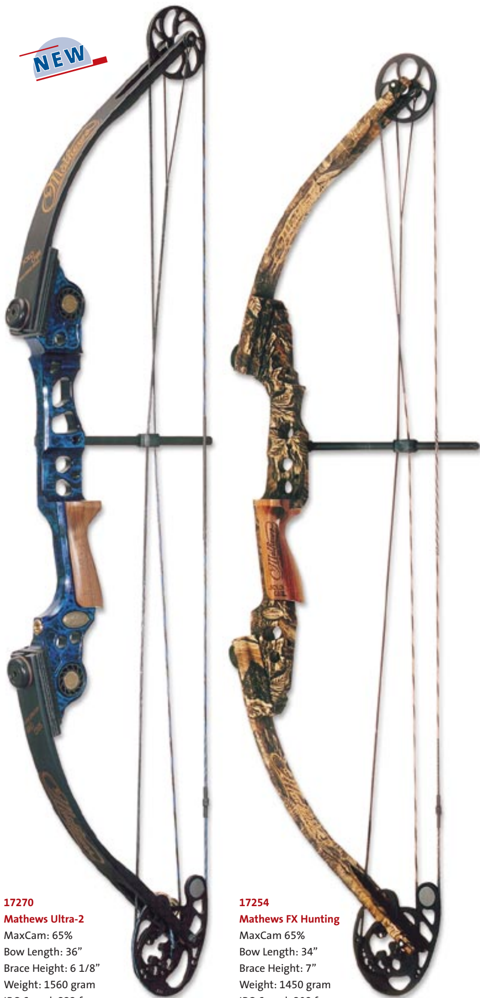
17270 Mathews Ultra-2 MaxCam: 65% Bow Length: 36" Brace Height: 6 1/8" Weight: 1560 gram IBO Speed: 322 fps.