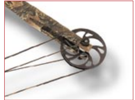
Ball-bearing Idler Wheel.

Long riser/short limb design - results in more stability and higher accuracy.