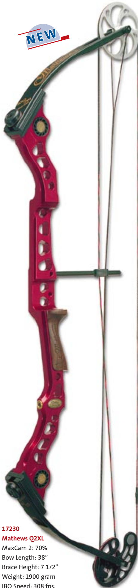
17230 Mathews Q2XL MaxCam 2: 70% Bow Length: 38" Brace Height: 7 1/2" Weight: 1900 gram IBO Speed: 308 fps.

Order by draw, no draw length adjustment possible