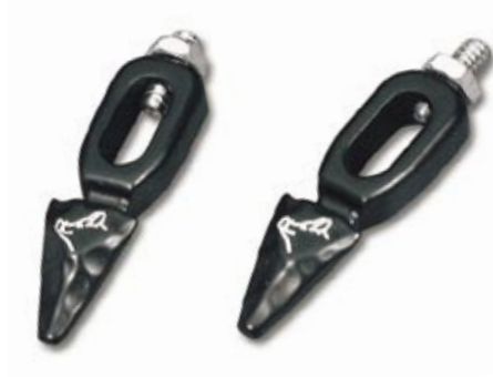
15855 Cascade Cable Adjuster

Now you can adjust cable-length easily for optimum wheel-timing.