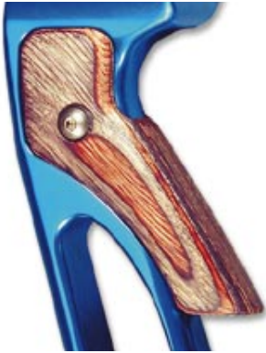
15750 Loesch Half Grip Low for Hoyt Tec Series

The Loesch grips, already a favourite among top competitors in both 3D and target in the U.S.A, now finally available in Europe also. We have selected these superb grips to enable you to experience the best possible grip for your bow.