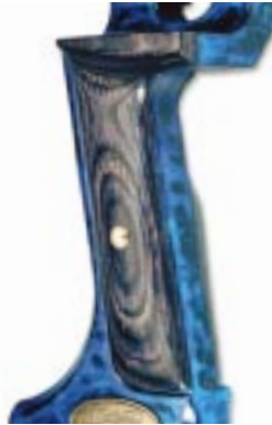
15760 Loesch Side Plates for Mathews

If you do like the quality of the Hoyt Tec series but have not found the extreme low grip angle to be very comfortable than try this grip.