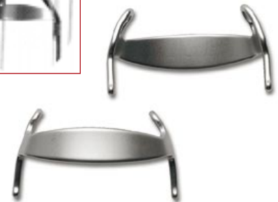
15850 Vital CenterShot Spreader Bar

This device eliminates the need for a cable guard. It eliminates bow torque and improves accuracy. It is easy to install and can be tied in securely. Made from lightweight aluminum.