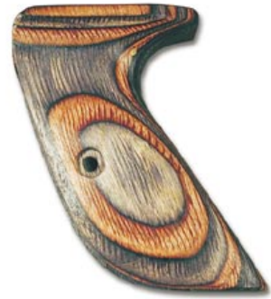
15770 Loesch Full Grip for Mathews

Many pro's choose to shoot a grip as narrow as possible to avoid torque and to improve accuracy.