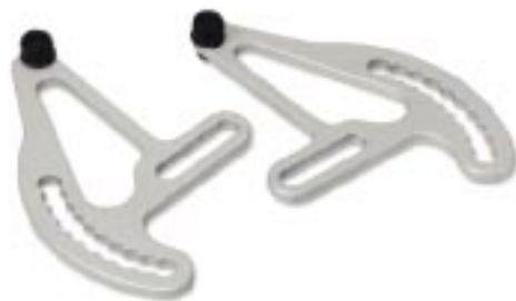
15800 WallBanger Draw Stop HTPC

For Hoyt accu wheel, command cam & power cam.