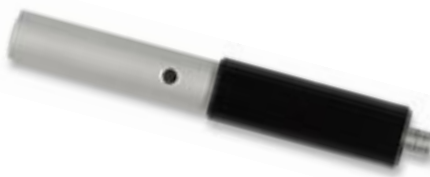
25720 AGF Extender *3", 5"