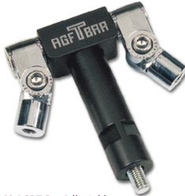
26040 AGF T-Bar Adjustable Combination of V-Bar and extension.