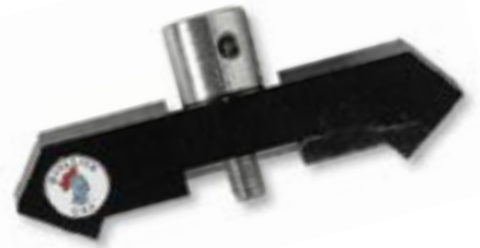
26100 Cavalier J-Bar Wide, one piece design. Personal choice of Jay Barrs. *Straight, angled.