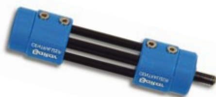
25790 Beiter Extender Blue 25791 Beiter Extender Black & White *4", 5", 6"