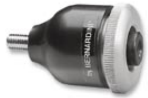
27100 Bernardini TFC To be coupled with long stabilizer or short 3D stabilizer, mostly used on compounds.