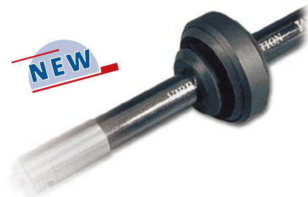
28070 Doinker Doe-Nut Slide the Doe-Nut over your stabilizer and adjust the position to get the best dampening possible. Includes three different weight rings.