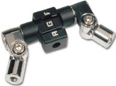
26020 AGF V-Bar This V-Bar features a three unit design for easy assembly. *5/16, M8