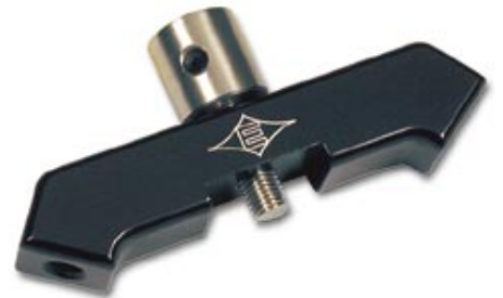
26110 Easton V-Bar *Straight, angled