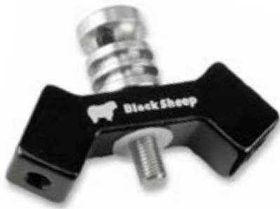
26010 Black Sheep V-Bar Best value in V-Bar's. Strong, yet lightweight design. *Straight, angled