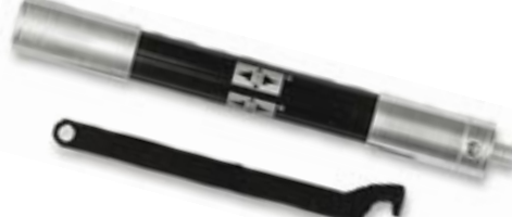
25740 Easton ACE Extender *4", 5"