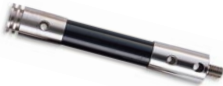
25700 Black Sheep Carbon Extender *3", 4", 5"