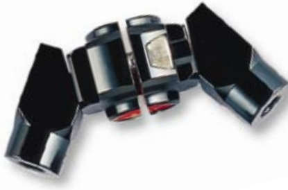
26014 Black Sheep E/E V-Bar To be clamped around stabilizer. Will fit Black Sheep stabilizers.