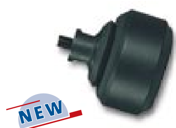
15887 Sims Enhancer 2000 Short - 2" Keeps weight as close to the bow as possible. Vibration reduction up to 60%. *Black, silver