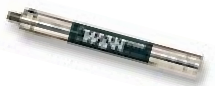
25780 Win & Win Fomax Extender *3", 4", 5"