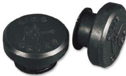
15870 Sims Solid Limb Saver

A lighter weight version especially developed for recurve bows to keep you from losing speed.