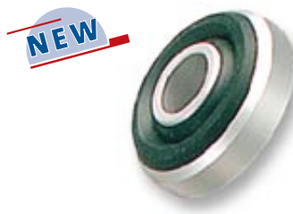
15860 PSE NV-System Black 15861 PSE NV-System Silver

Produced from aluminum and Sims Navcom material this dampening system is mounted by using the limb bolts.