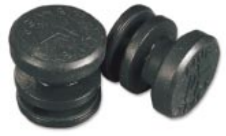
15875 Sims Split Limb Saver

Revolutionary product that is popular with both recurve and compound archers.