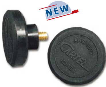
15865 Cartel Handle Saver

It will add very little weight but will greatly reduce vibrations.