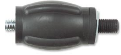
28060 Doinker Back Damper

Designed for the larger diameter stabilizers such as a number of compound stabilizers.