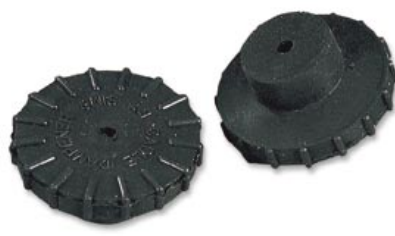
15890 Sims Cable Dampener

Will fit any large diameter stabilizer with 5/16 or 1/4 size bolt hole, or 1/4 size bolt.