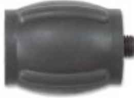
28030 Doinker top damper 1"

This Doinker will be your best choice for most stabilizers. *Stiffness: medium, hard