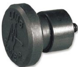
15885 Sims Stabilizer Enhancer

Designed specifically for split limbs. Can be repositioned for optimum dampening.