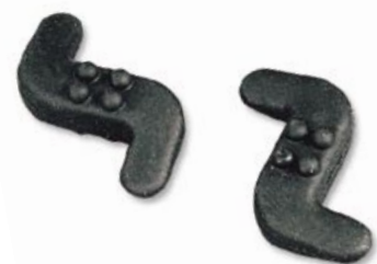
43620 Sims String Leech

To be mounted on the cable guard. Will act as a cable slide stop and will further reduce vibrations.