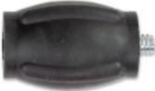
28000 Doinker top damper 3/4"

This Doinker will be your best choice for most stabilizers. *Stiffness: medium, hard