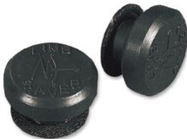
15880 Sims Recurve Limb Saver

Perfectly sized for attachment to most sights and accessories.