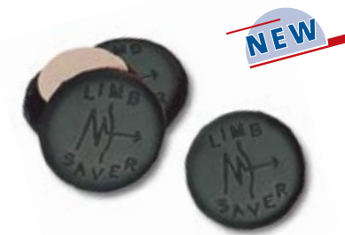
15882 Sims Mini/Accessory Limb Saver

Produced from aluminum and Sims Navcom material this dampening system is mounted by using the limb bolts.